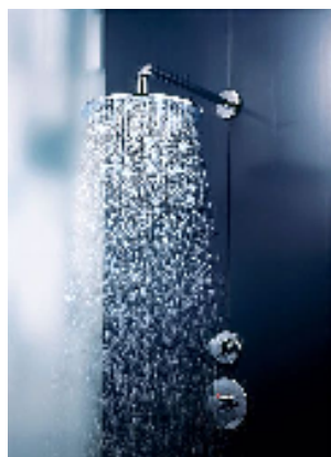
Alternate the hot with the cold and repeat three times.