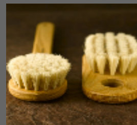
Natural Bristle Brush